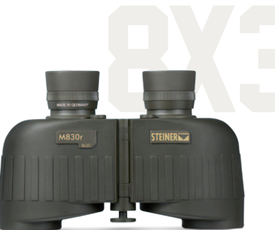
ITEM NUMBER 2641