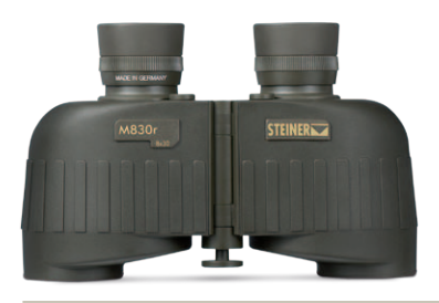
ITEM NUMBER 2640